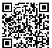
SCAN TO SEE VIDEO